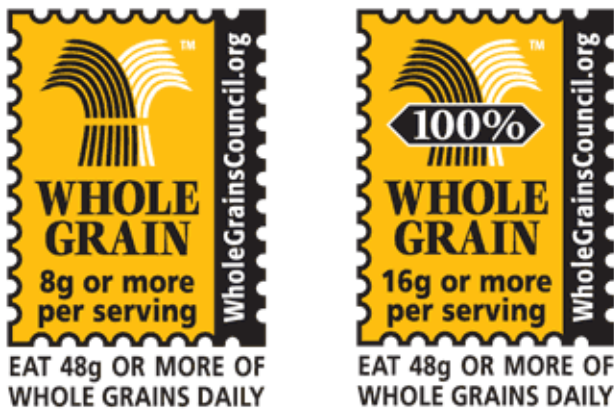
Whole Grain Stamps are a trademark of Oldways Preservation Trust and the Whole Grains Council.

Remember, just because it's brown, it doesn't mean it's whole grain. Often times food processors add caramel coloring, molasses, or other ingredients to the flour to make it look like the whole grain product. Also, foods labeled with the words "multi-grain," "stone-ground," or "100% wheat" are usually NOT whole grain. When identifying a whole grain product look for the Whole Grain Stamp that identifies if the product is 100% whole grain or contains 8g of whole grains per serving.